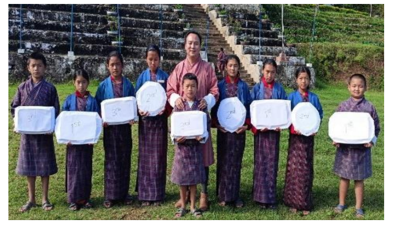
The Khoyar PS family joined the nation in marking the third day celebration of HRH the princess's birth by organizing a range of activities and awarding prizes to the victors. They concluded the day by offering prayers.