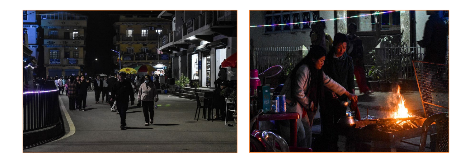
Pic 5. Food festival, stall and Sale [14-18/12/22]